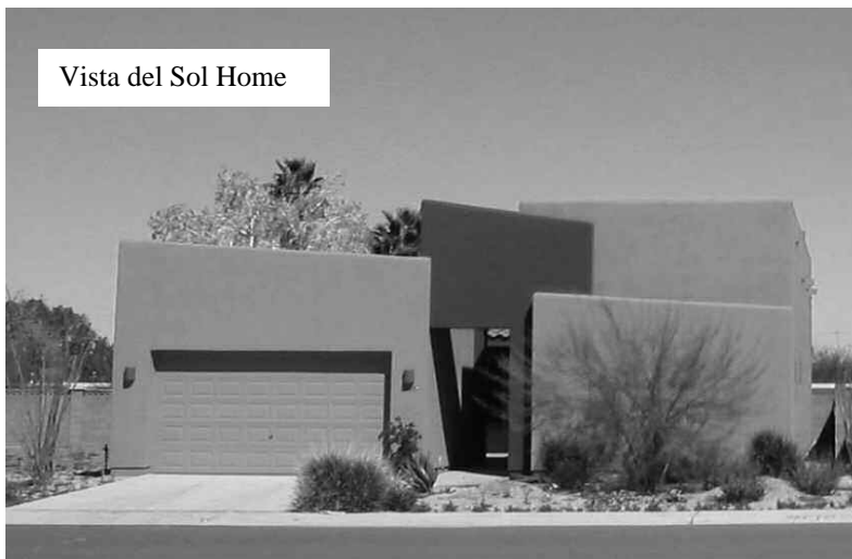
Vista del Sol Home