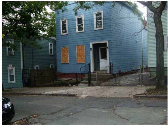
A foreclosed and vacant unit in Chelsea