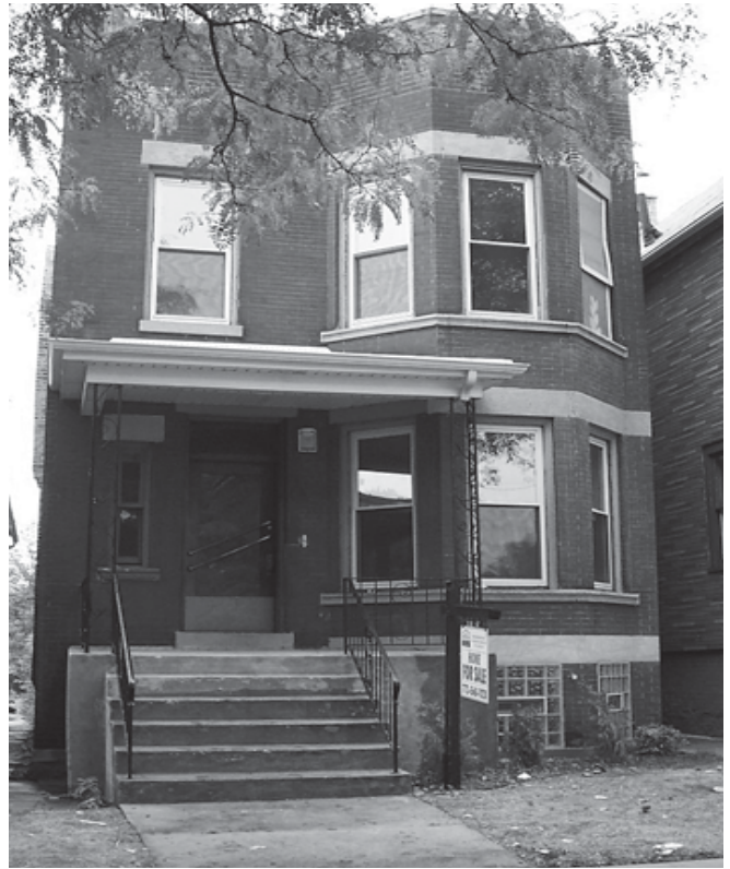
Before and after photos of 7013 S. Eggleston in the Auburn Gresham/Englewood neighborhood in Chicago. Before entering the TBI2 program the vacant property had multiple code violations and was used by area gangs. NHS acquired the home, rehabbed it, and sold it to a first time homebuyer.