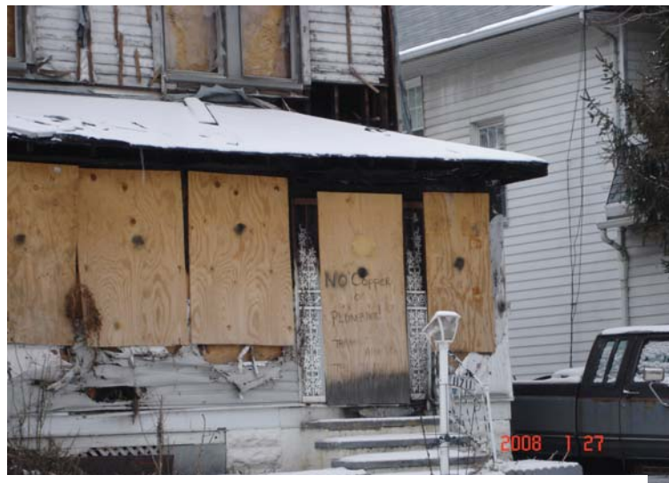
A vacant, boarded Cleveland house with aluminum siding stripped. The handwritten message to would-be vandals, scrawled on the plywood, reads "No Copper or Plumbing! Thanks a lot."