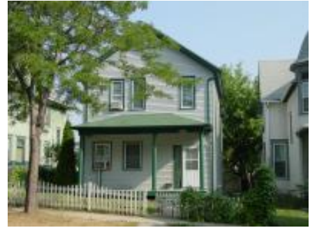
A unit renovated by Dayton's Bluff.

Dayton's Bluff is a seasoned CDC with extensive experience in both single family and multi-family housing. But the scale of the foreclosure crisis threatens to overwhelm its efforts. On its own, Dayton's Bluff could not wield the political clout needed to bring servicers, politicians, and other policymakers to the table with the speed required in order to marshal a timely response. Nor would it be able to raise the huge amounts of capital required to acquire and renovate properties. At the same time, the consortia and collaborative that have grown up in the Twin Cities area could not be effective without groups like Dayton's Bluff. Both are part of the essential infrastructure that will be needed to turn thousands of vacant, foreclosed properties from neighborhood eyesores to neighborhood assets.