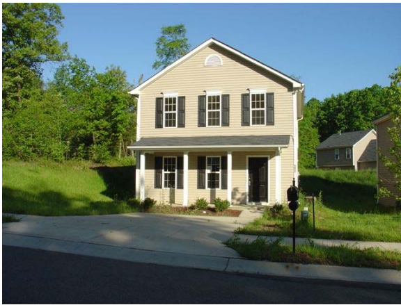
A unit in the Peachtree Hills subdivision.